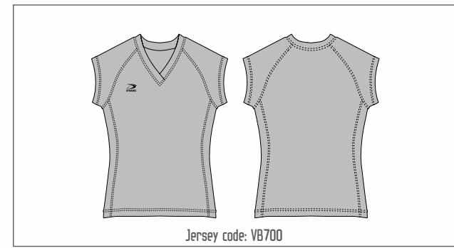
Jersey code: VB700 Raglan short sleeve w/ side panels