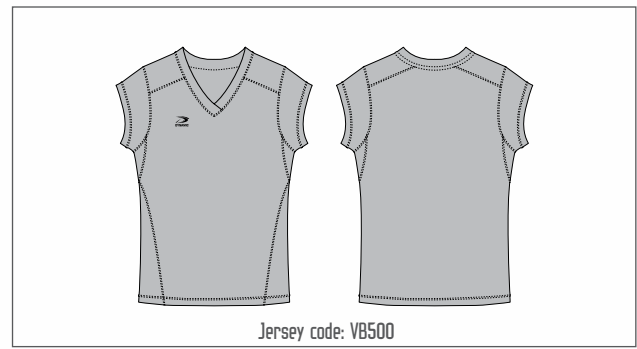
Jersey code: VB500 Cap sleeve w/ shoulder yoke/under arm gusset